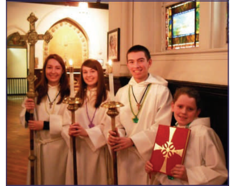
Acolytes join in the spirit of Mardi Gras.